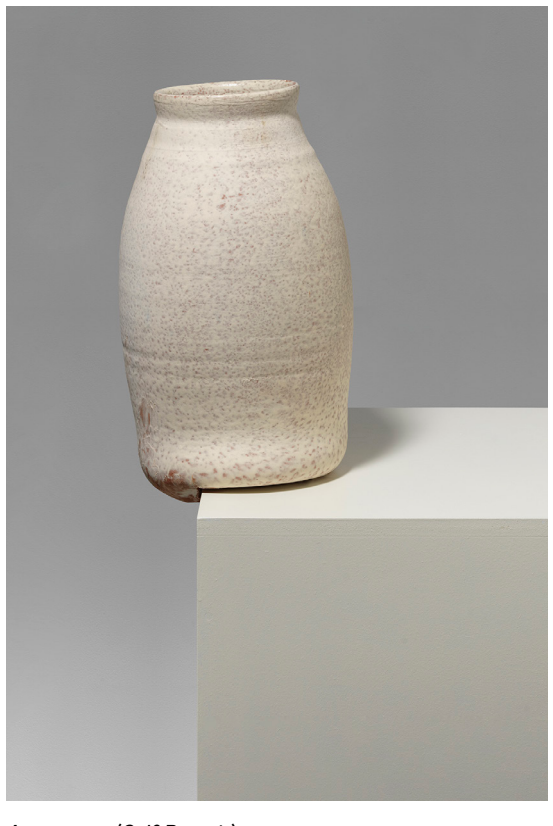
Autoretrat (Self Portait) (2022) 20 × 20 × 37 cm

titles and compositions. Indeed, Alcaraz foregrounds a fusion of contradictory elements, alternating between light and darkness, robustness and fragility, unveiling and obscuring. The resultant body of work has a certain ethereality, highlighting the changing nature of our environment and almost forcing us to establish a metaphorical relationship with the world around us.