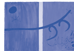
Joan Miró Untitled (Project for “El vol de l'alosa”) (1973) Gouache and Indian, ink on paper 45 x 65 cm (17.7 x 25.6 in.)