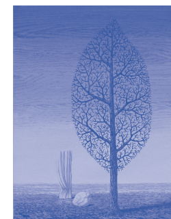
René Magritte La Recherche de l'absolu (1948) Gouache on paper 45,3 x 35 cm (14 3/8 x 17 1/2 in.)